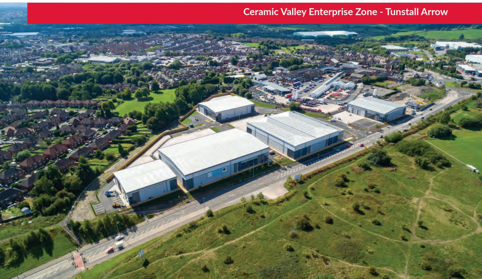
Ceramic Valley Enterprise Zone - Tunstall Arrow

Much of this success is down to the Ceramic Valley Enterprise Zone, which is why the city council and the Staffordshire and Stoke-on-Trent Local Enterprise Partnership have committed to extend the business rate discount incentive scheme for another five years, to give ourselves every chance of developing out the remaining sites. It also comes as planning approval has been granted for Tunstall Arrow Phase 2, providing an additional 109,250 sq ft of industrial workspace on a 7.3-acre plot. The scheme will not only see remedial work to repurpose this brownfield land but is expected to attract further inward investment and provide over 200 new job opportunities in the local area.