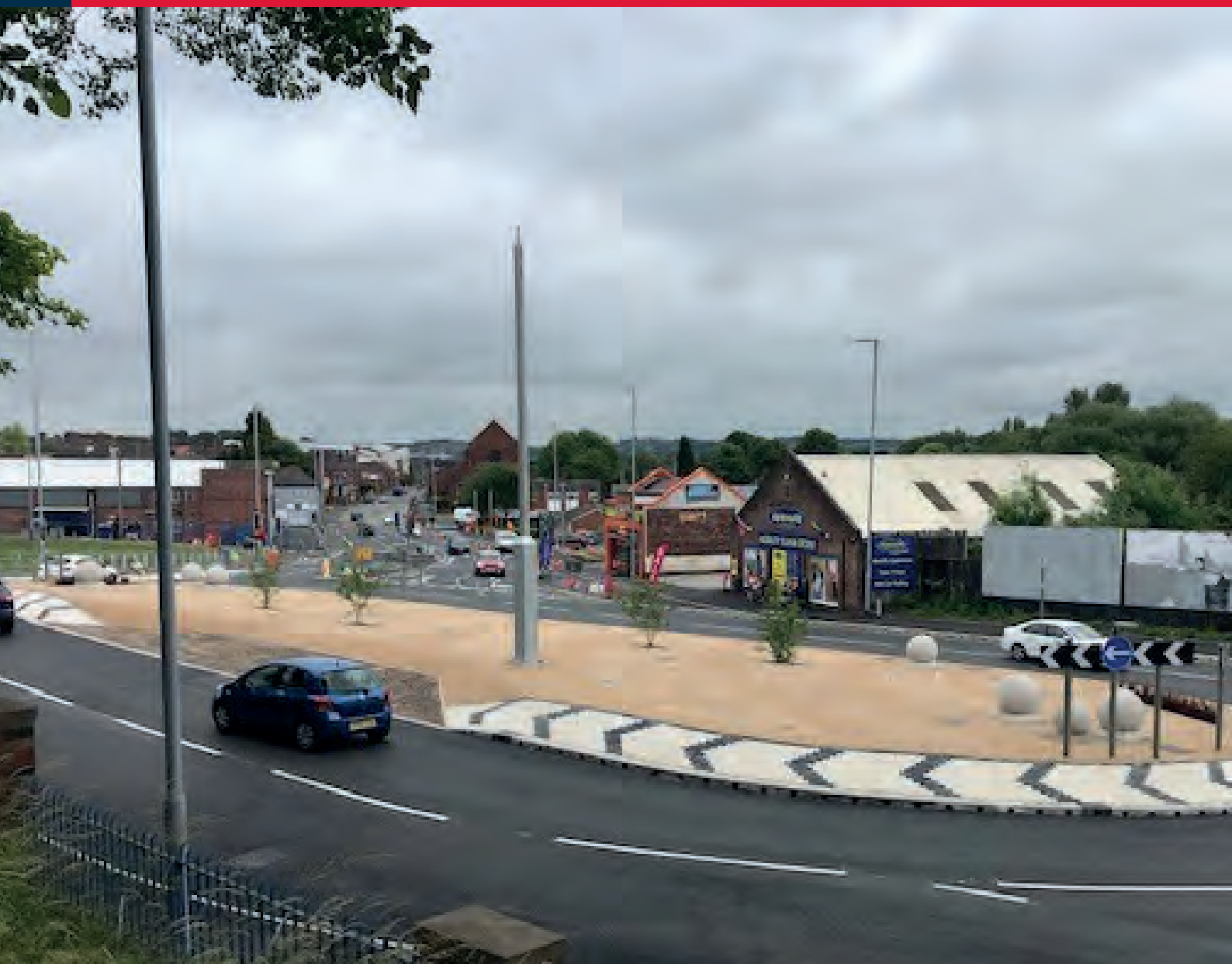
Joiner's Square roundabout

In the meantime, we are cracking on with improvements. The development of the Etruria Valley Link Road is underway and is due to complete in December 2022. We are tackling key pinch-points in the city such as Bucknall New Road corridor, Waterloo Road / Cobridge Road Junction and the recently completed roundabout works at Joiners Square. We are investing more than ever before in maintaining and improving the road network, with £13.17 million being invested this year that will deliver 60 miles of resurfaced carriageway.